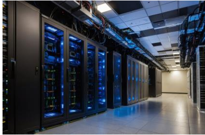
DESIGN & IMPLEMENTATION OF BACKBONE BMS ACROSS MULTIPLE DRC & DC LOCATIONS

Client: Major Data Center Operator. (Six Markets across APAC)