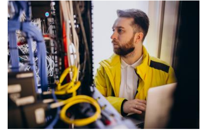
SELECTED DESIGN AND IMPLEMENTATION PROJECTS ACROSS DATA CENTERS

Result: The MMR Cross Connect is operating as intended with Ozark providing support services.