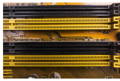
DESIGN & IMPLEMENTATION OF MKR CROSS CONNECT, STRUCTURED CABLING AND MANHOLE

Result: The WIFI Network is operating as intended with Ozark providing support services.