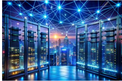
DESIGN & IMPLEMENTATION OF WIFI NETWORK AND MONITORING ACROSS MULTIPLE DC LOCATIONS

Result: The client has a successfully implemented system with Ozark providing support services.